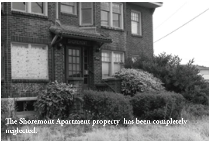
The Shoremont Apartment property has been completely neglected.